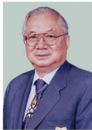
Sir Gordon WU GBS KCMG FICE Chairman, Hopewell Holdings Limited