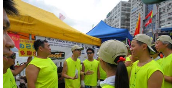
Dragon Boat Race in Chai Wan on 13 June 2010