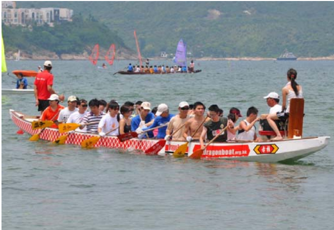
Training Session in Stanley on 6 June 2010