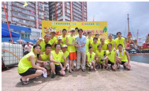
Dragon Boat Race in Stanley on 16 June 2010