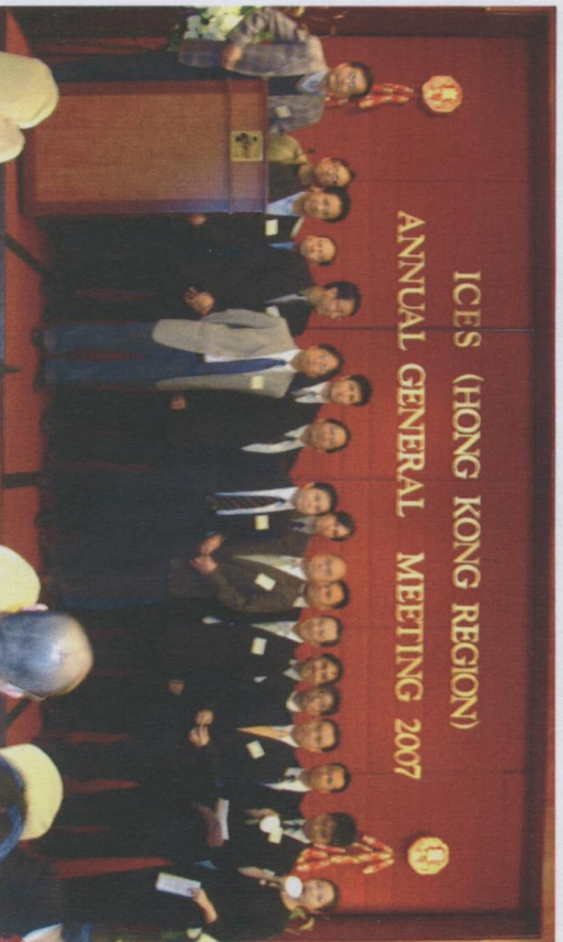
The incoming Committee Members for Session 2007/08 were installed.